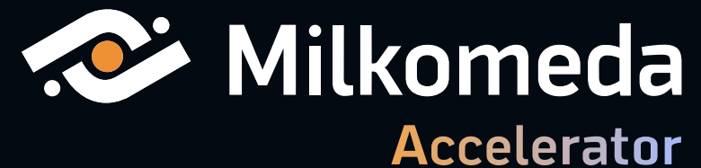
Full white (gradient)