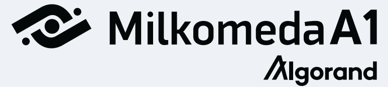
Full black (Algorand)