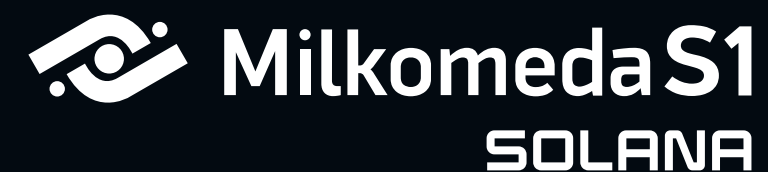
Full white (Solana)