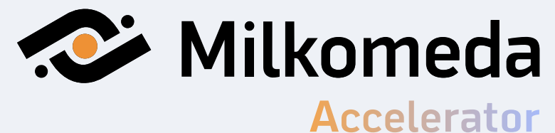
Full white gradient