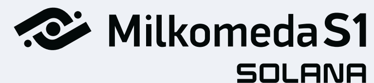
Full black (Solana)